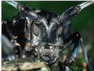
Asian Longhorned Beetle