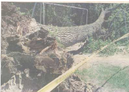
Two children narrowly escaped injury yesterday after this tree fell, crushing a swing set.